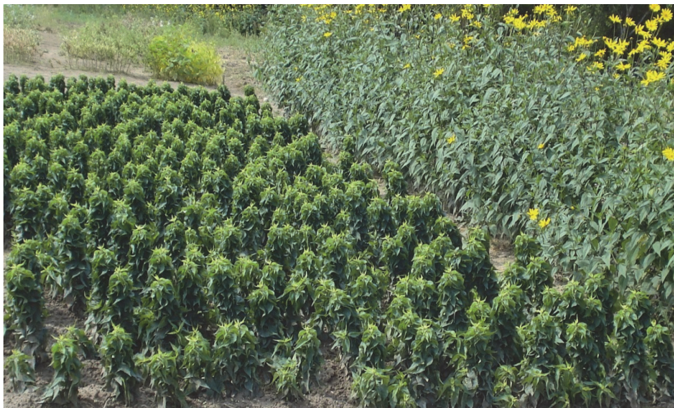
Figure 4. View of the cv 'Anastas' in comparison with the standard cv 'Dessert' (on the right)

sympodial branches are strongly shortened; the foliage is abundant (the proportion of leaves from the mass of plants is ~55 %). His dark green leaves are xeromorphic. The leaf mass per unit leaf area, i.e. specific leaf weight (SLW) ~8.6 mg/cm 2 . The leaf area index (LAI) ~5.6 m 2 leaves/m 2 of field (at density ~9×10 4 plants/ha). The Anastas tuber nest is moderately compact (3.3 dm 3 ); his tubers have an elongated-oval shape and are easily separated from stolons (Figure 1c). The surface of the Anastas tubers is moderately smooth (no outgrowths and 'bulbs'). The tuber buds are depressed and their depth is shallow. The color of the tuber peel is dark-red; the tuber flesh is white; their mass varies from 40 g to 90 g. Anastas tubers have a moderately developed cork layer. Anastas vegetation period from planting (in middle April) to harvesting tubers (in middle October) is 170...180 days (R.B., Minsk). As mentioned before Anastas cv is highly resistant to extreme environmental factors (to the main economically significant disease of Sclerotinia , to drought, to lodging). The cultivation and harvesting technology of Anastas is similar to that of potatoes. The yield of tubers at optimal agrocoenosis density reached 45÷55 t/ha. Anastas tubers are well suited for the industrial processing to obtain food, inulin, fructose, pharmpreparations, ethanol etc. The ripened crushed leaf-stem mass can be used as mulch.