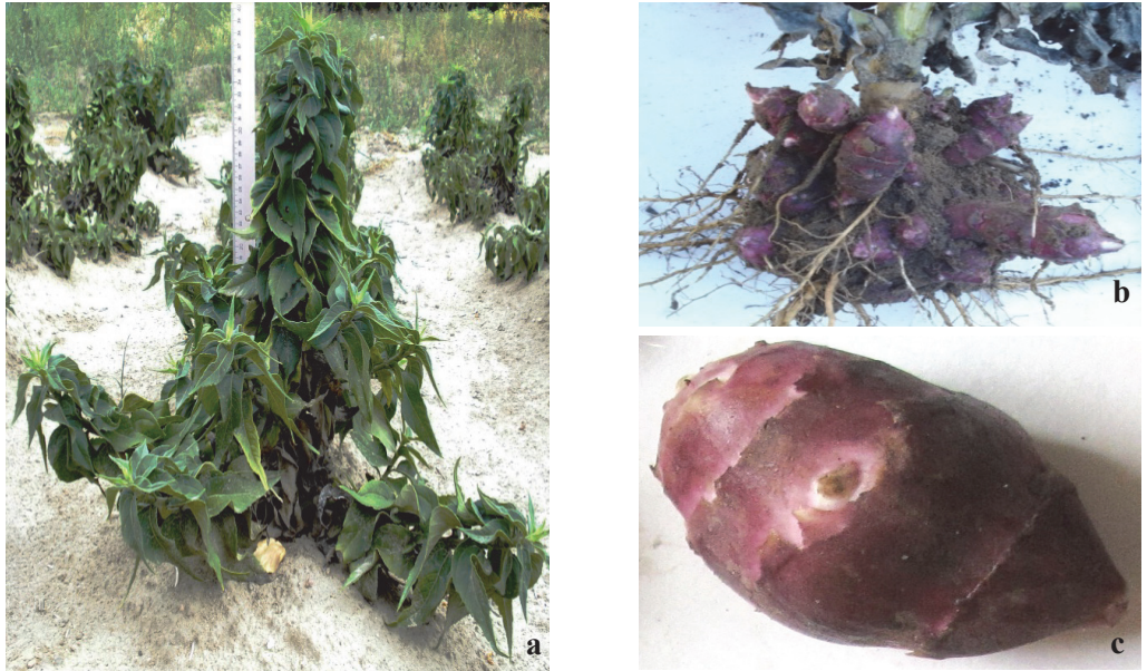
Figure 1. Natural model of intensive topinambour cultivar for tuber production (a), topinambour tuber nest (b) and tuber (c)